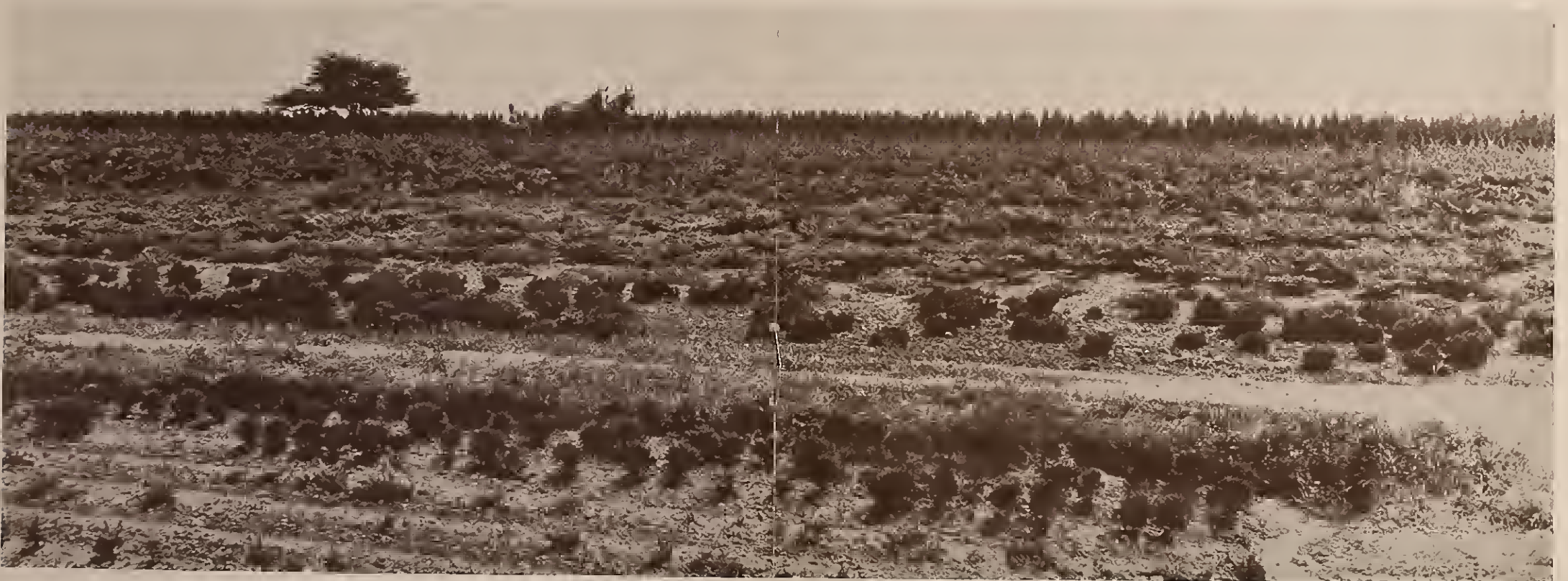
Block of Dwarf Evergreens. Thuja pyramidalis in back ground.